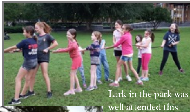
Lark in the park was well attended this

East Side Floor. Liffey,, Starcel. Building Link, F&F, LTB, MWB Electric. Colony Pest Mgmt., Horizon Windows Kenny Building Services, Securicom, Tuttles Bar,.