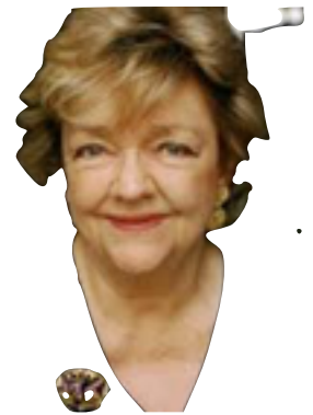
... or even better

Lets Break the sterotype. Maeve Binchy, Alfred Nobel and Oscar know much better than that.