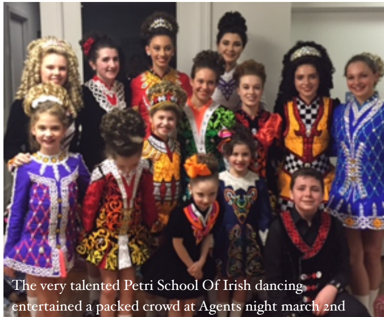
The very talented Petri School Of Irish dancing entertained a packed crowd at Agents night march 2nd