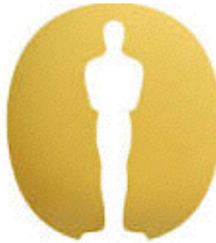
... or even this guy