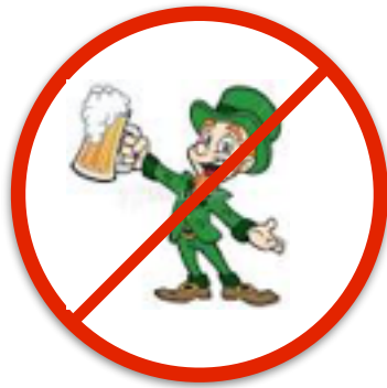
Lets Move away from this guy